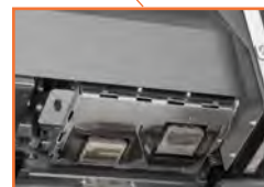
Staggered Dual Print Heads