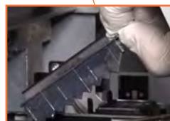
Replaceable Print Wiper