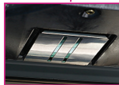
AccuFine print head