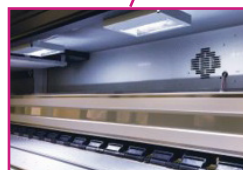
Internal LED Lighting