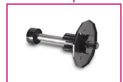
Media Flange for improved handling

MUTOH's genuine VerteLith RIP software bundled with FlexiDESIGNER MUTOH Edition 21 optimizes the XPJ-1641SR Pro through these key features: