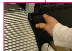
Multi-stage pressure mechanism